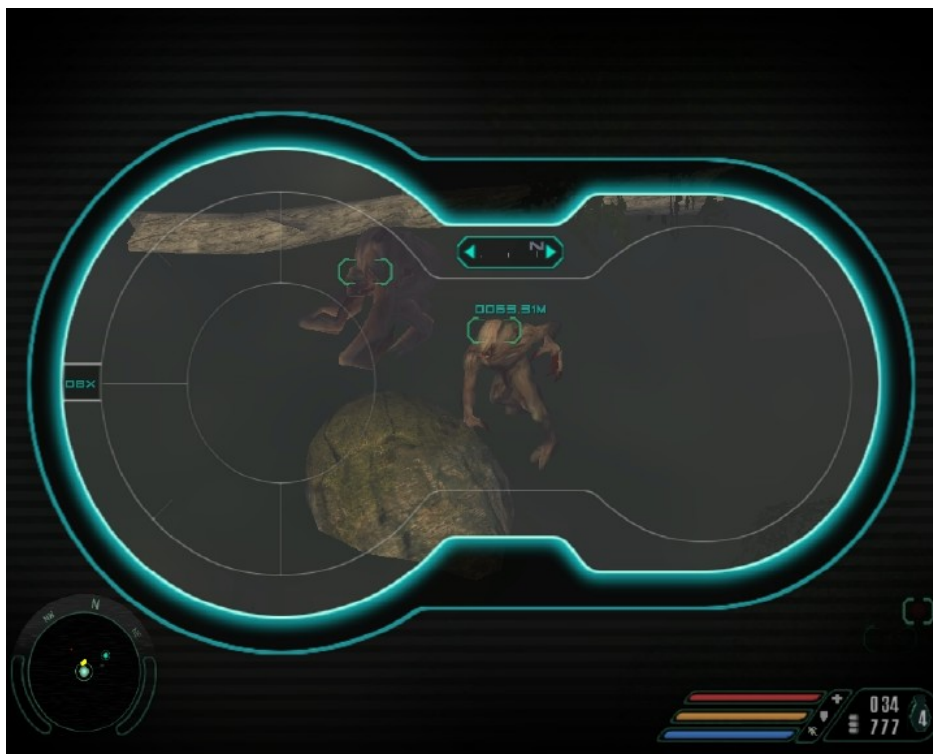
Fig 2. Far Cry’s Trigen: prior to seeing them, we are told they are genetically engineered apes, the visual appearance and movement then supports this.

Any cues for anthropomorphism, once added to the agent’s available actions, and judging by the simplicity of the state-system and visual representation of Doom’s Imps (see Fig 1), are enough to initiate the Intentional Stance. Very simple rules of behaviour, supported by an appropriate context of action, enable the anthropomorphising tendencies of the intentional stance to bootstrap function into new conceptual – and illusory – degrees of projected mind.