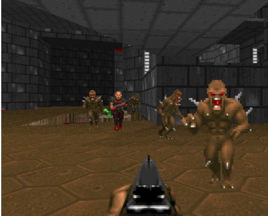
Fig 1. Imps and Zombies in Doom (1993): both AI and visual representation are very simple.

Doom's imps and zombies are intelligent in only the most rudimentary way but it doesn't matter. The imp turned on the zombie because it was hurt and responded in rage; the reaction is easy to anthropomorphise because it is so familiar. Critically, although it does not require Intentionality, cognition, or any form of evident higher order deliberation to be anchored to the agent, merely a simple rule, it is recognisably, anthropomorphically instinctive and causal. The imp attacked the zombie because the zombie shot the imp.